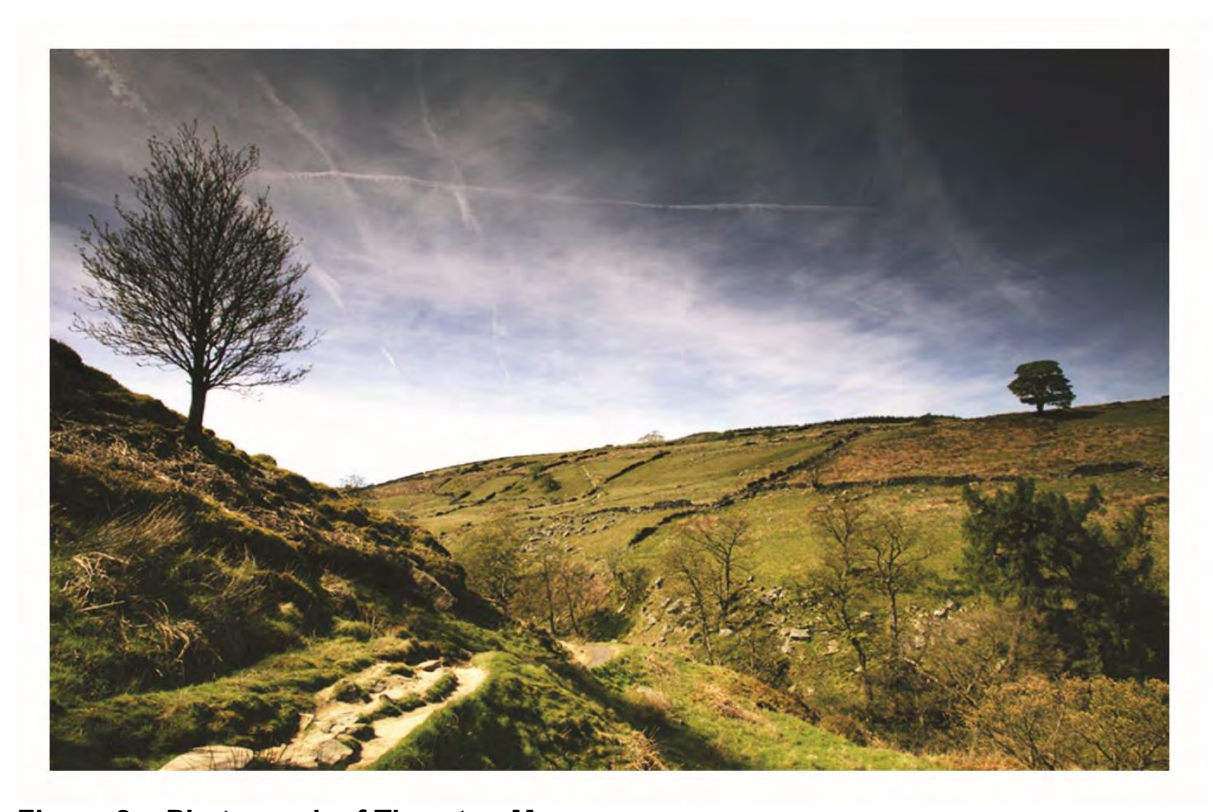
Figure 2a: Photograph of Thornton Moor